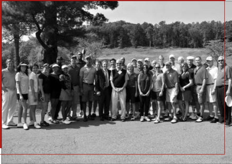
TELEVISION, RADIO AND SPORTS CELEBRITIES TURN OUT FOR THE 2012 CELEBRITY GOLF TOURNAMENT