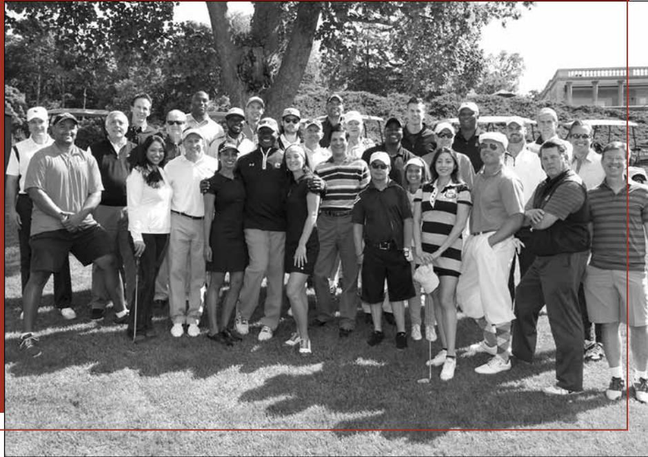
TELEVISION, RADIO AND SPORTS CELEBRITIES TURN OUT FOR THE 2013 CELEBRITY GOLF TOURNAMENT