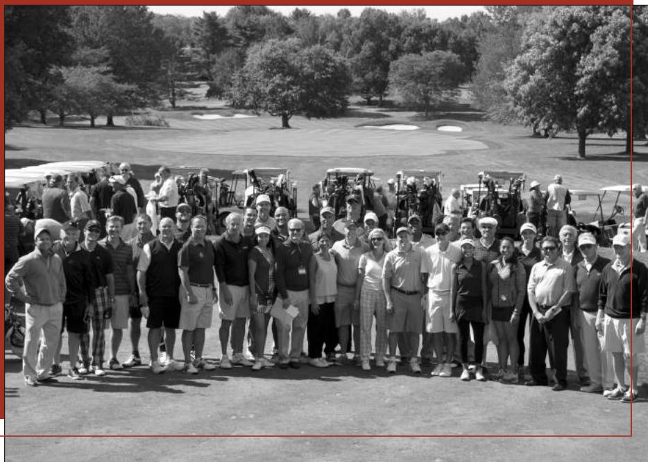
TELEVISION, RADIO AND SPORTS CELEBRITIES TURN OUT FOR THE 2015 CELEBRITY GOLF TOURNAMENT