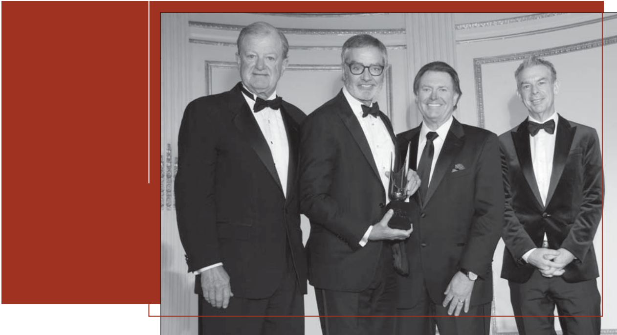
Jim Thompson, Bob Pittman, Dan Mason and Elvis Duran