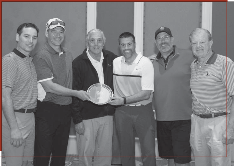
Meredith Broadcasting Group, Low Gross Winners